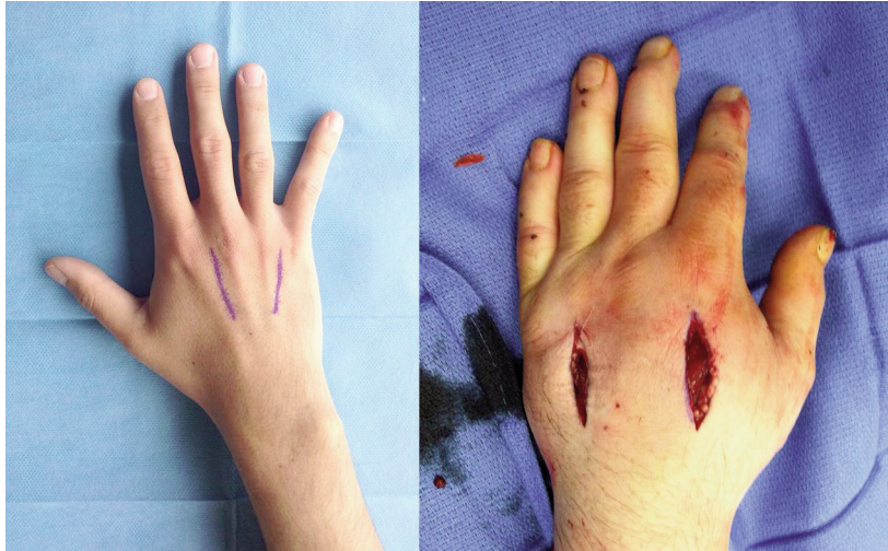
Figure 3. Surgical approach for decompressing interosseal compartments and fasciotomy of the hand.

ers groups (6, 39 and 15 patients respectively). Than better results have been reported by patients who received delayed primary closure of the wounds after 8 to 14 days from fasciotomy compared to patients whose wounds were closed after more than 14 days. Primary direct wounds closure is rarely performed and in a systematic review of literature only 15% received primary closure while most patients (59%) received delayed primary closure of the fasciotomy incision 33 .