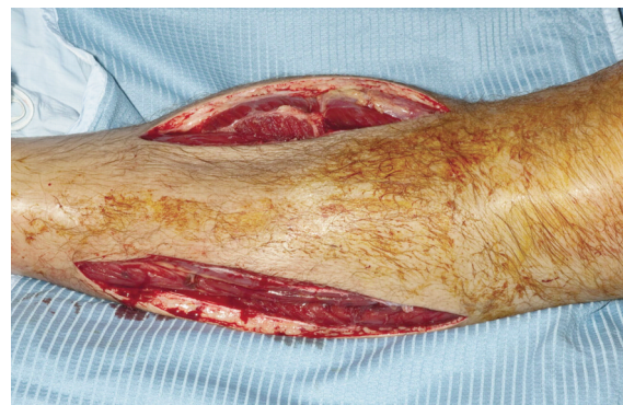
Figure 1. Medial and lateral incisions for leg fasciotomy.

The timing of wound closure is still debate in literature. Delaying closure for about seven days allows wound edges approximation at closure. The wound edges need to be frequently irrigated and debrided before final closure, and skin graft may be useful 31 . Dover et al. 32 reported better results with healing by secondary intention, followed by delayed primary closure and skin grafting, even if the number of patients who heal by secondary intention was smaller than oth-