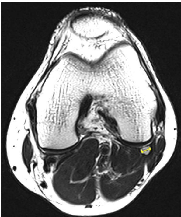
Figure 3. Axial section MR image of the knee demonstrates the measurement of the maximum width of the fabella.