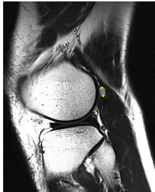
Figure 1. Sagittal section MR image of the knee demonstrates the measurement of the maximum length of the fabella.

The patient data was collected from the hospital's data management system (BESTCare 2.0) from the Radiology Department, King Abdullah Military City Hospital, Al Ahsa, Saudi Arabia. The digital bilateral radiographs and MRI scans of the knee were reviewed using the Picture Archiving Communication System (PACS). In general, radiographs of the knee were used to identify bony fabellae, and MRI scans to detect both bony and cartilaginous fabellae. All the identified fabella were osseous structures located in the lateral heads of gastrocnemius. The incidence of bony fabella on the MRI scans and radiographs of both sides of the knees was documented according to age and sex. The whole study group subjects were classified into five age groups at an interval of ten years. The following parameters, maximum length ( figure 1 ), maximum thickness of the fabella ( figure 2 ), and maximum width ( figure 3 ), were measured using different MRI views (sagittal, and axial views). One researcher independently measured all the fabella measurements using the software-integrated ruler functionality. The measurements were repeated twice, and the average value was calculated.